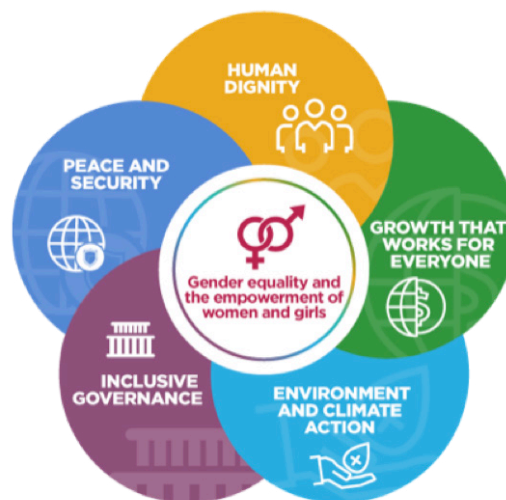
Figure 1: FIAP Action Areas 8

Against this backdrop, GAC-IA recognized the need for agency-tailored indicators that could better inform the results of the FIAP. To begin, GAC-IA reviewed its existing portfolio and identified six “interrelated global challenges” – referred to as Action Areas – to serve as entry points for empowering women and girls.