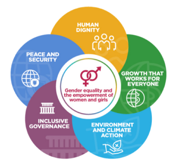
Figure 1: FIAP Action Areas8

Against this backdrop, GAC-IA recognized the need for agency-tailored indicators that could better inform the results of the FIAP. To begin, GAC-IA reviewed its existing portfolio and identified six "interrelated global challenges" – referred to as Action Areas – to serve as entry points for empowering women and girls.